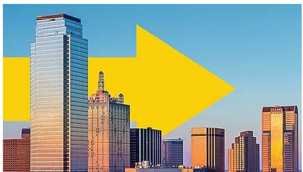
Shell Energy offers a comprehensive suite of tailored products and solutions, including rapidly growing capacity, trading and technical expertise and smart energy solutions, serving customers across the commercial and industrial sectors.