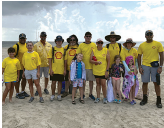
PHOTO: Volunteers from Geismar and Norco participate in a beach clean-up day in Grand Isle, La.

The volunteers spent the day walking along the beach, helping to rid it of small pieces of garbage and even some large pieces that got thrown around from previous storms and high tide. Many Shell employees also brought their children, so they could play at the beach while doing some valuable work for the community. Many volunteers were happy to see Shell's active support of environmental initiatives such as this!