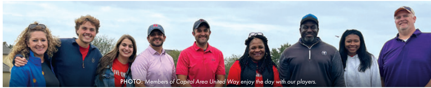
PHOTO: Members of Capital Area United Way enjoy the day with our players.