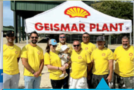
Convent and Geismar's Environmental departments participate in Ascension Parish's Household Hazardous Materials Collection Day.