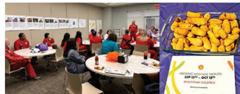
PHOTO: Geismar employees enjoy a cultural lunch and learn in honor of Hispanic Heritage Month.