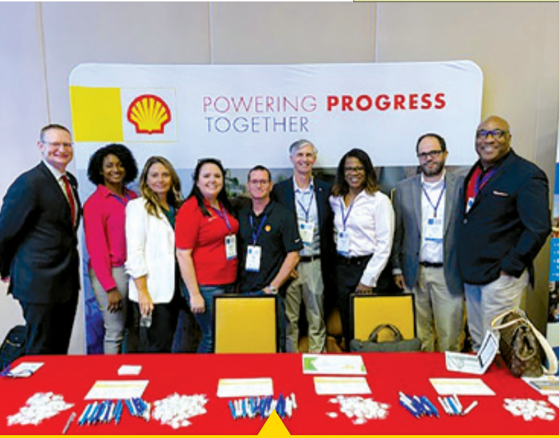
Representatives from Geismar, Convent, Norco, Deer Park and Shell diversity teams attended the Baton Rouge Area Chamber Economic Inclusion Symposium.