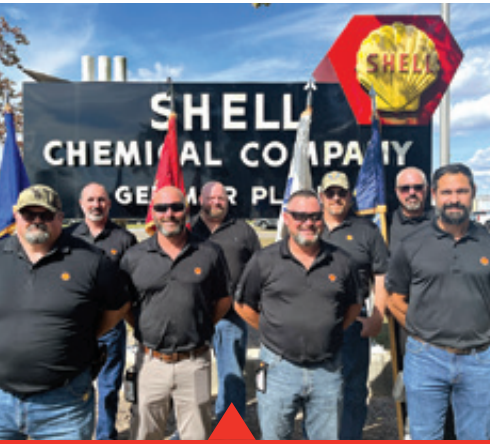
MILNET hosts a Veterans Day celebration at Geismar.