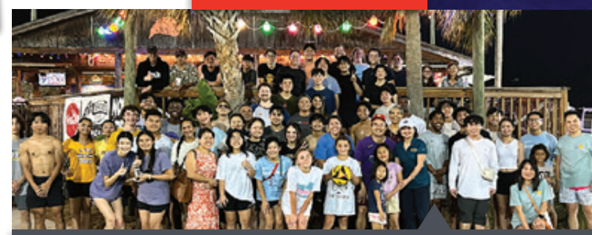
SAPENG participates in a Society of Asian Scientists and Engineers' volleyball social in partnership with LSU.