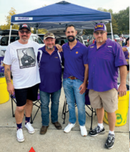
Geismar hosts tailgate party for employees before LSU and Southern University football games.