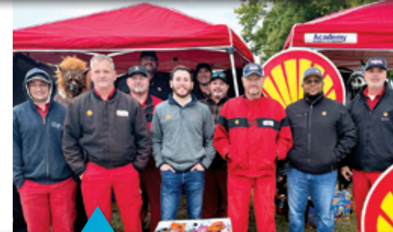
Convent leads efforts at Cypress Grove's "Trunk-r-Treat" event.