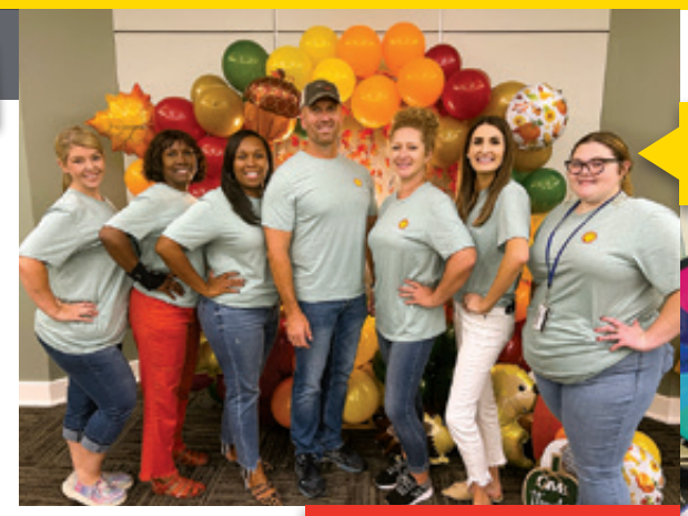
Geismar hosts the annual Fall Health Fair.

The Rhythm of Louisiana shell.us/louisiana | #PoweringProgress