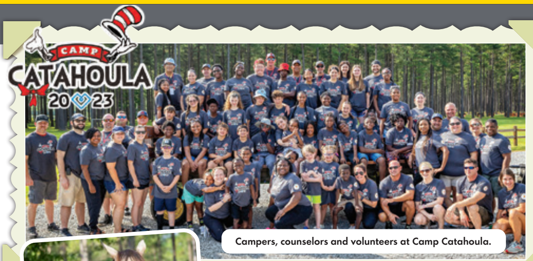
Campers, counselors and volunteers at Camp Catahoula.