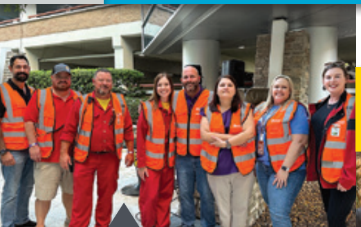
MILNET provides a safe trick-or-treating opportunity to OLOL patients and staff.