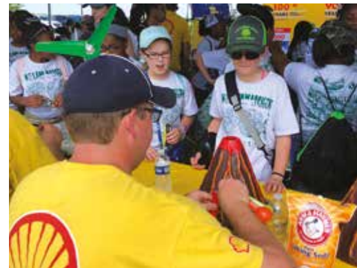
Make your own volcano. Area students learn about chemical reactions while watching a Norco volunteer trigger a "lava" explosion.

N ow in its 22nd year, Wetland Watchers is a nationally recognized school-based service-learning project for middle schoolers who participate in a variety of service activities to improve their local habitat and community. The Wetland Watchers Celebration features corporate, non-profit, state, local and national organizations who provide interactive displays and activities designed to teach the students about the environment and how to become stewards of Louisiana's wetlands.