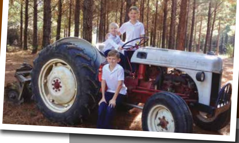
The Henderson kids learn about the environment by helping out at the family tree farm.