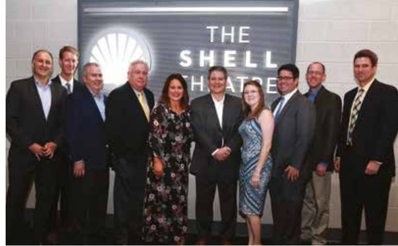
Shell Norco, Geismar and Convent representatives are pictured in front of The Shell Theatre during the Lafon Arts Center dedication ceremonies.