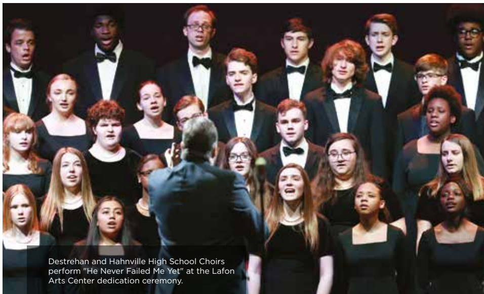
Destrehan and Hahnville High School Choirs perform "He Never Failed Me Yet" at the Lafon Arts Center dedication ceremony.